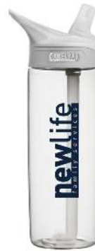
20oz. Camelbak Water Bottle with New Life logo