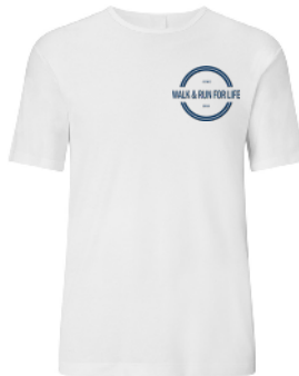
Walk for Life T-Shirt (2017 Pictured)