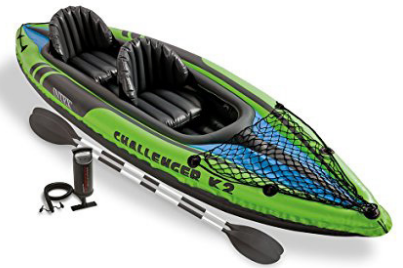
Intex Challenger K2 Kayak, 2-Person Inflatable Kayak Set with Aluminum Oars