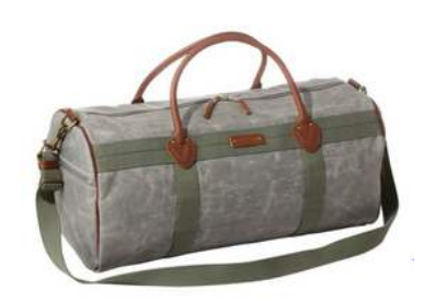
$2,000 or more L.L. Bean Canvas Duffle