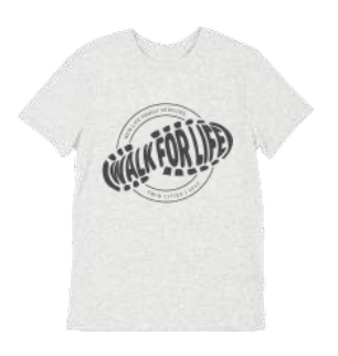
$100 or more Walk for Life T-Shirt