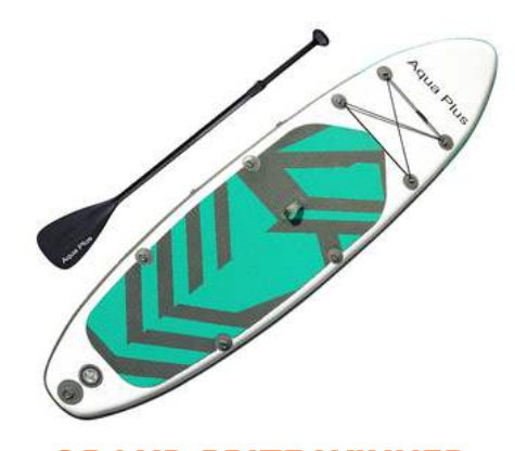
GRAND PRIZE WINNER

The individual that raises the most money will receive a grand prize of a blow up paddle board!