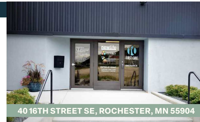
40 16TH STREET SE, ROCHESTER, MN 55904

Very helpful and friendly! They have a lot of resources and are willing to talk with you for anything you need.