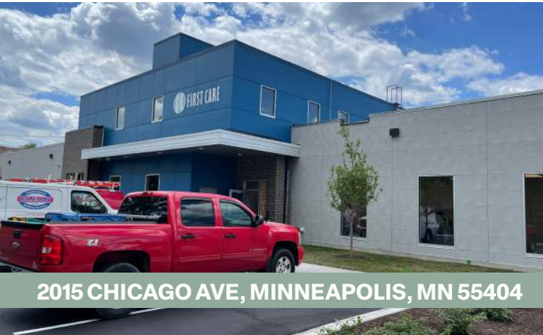
2015 CHICAGO AVE, MINNEAPOLIS, MN 55404