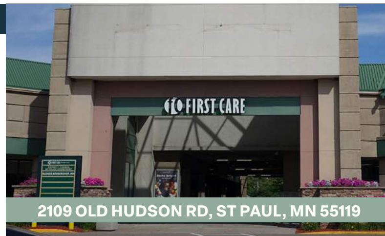
2109 OLD HUDSON RD, ST PAUL, MN 55119

First Care Pregnancy Center is the BEST!!! I have [met] nothing but great people, all very helpful and friendly!