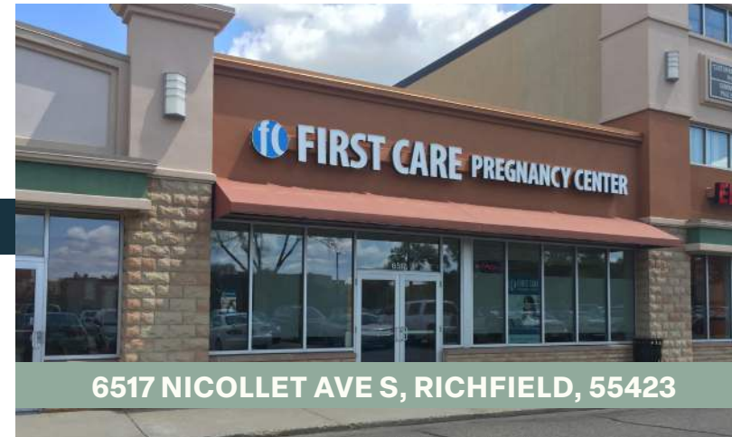
6517 NICOLLET AVE S, RICHFIELD, 55423

IMPACT We have built up partnerships in the community and have steadily increased our client numbers over the past 18 months. During the first quarter of this year, we provided 198 client service appointments.