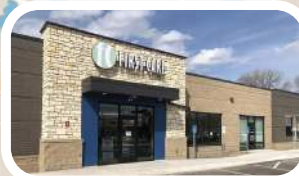
First Care Saint Paul