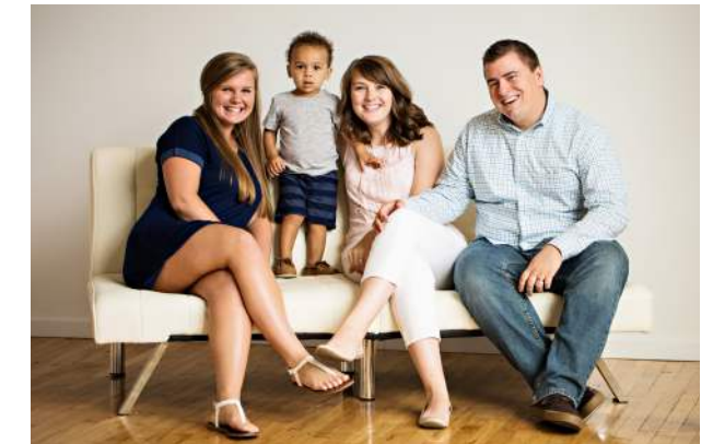
New Life adoptive family and birth mother.

While advancing technology and new laws may change how reunions can happen, they do not change our mission. Whether helping adoptees prepare for unexpected connections, counseling birth parents, or equipping adoptive families, New Life Adoptions remains committed to holistic support grounded in the love of Christ. Amid cultural shifts, we are reminded of God's steady faithfulness in every unique adoption story. ■