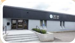
First Care Rochester 80 mi south