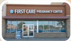
First Care Richfield